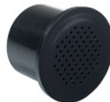
Active charcoal filter - FILTRE1 It's recommended to change it every years.

**Thanks to the Vinotag® application, benefit from a digital register of your wine cellar and be alerted of the peak dates of your wines. In partnership with Vivino, scan your bottle to access its pre-filled wine sheet.